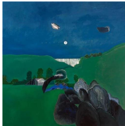
Bolinas Ridge, 1962.