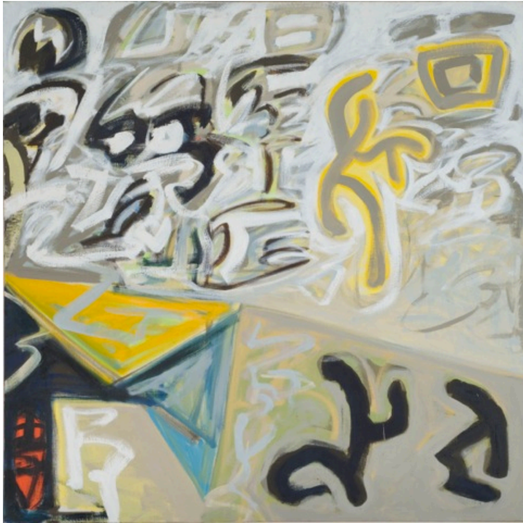
Ideograph , 1989, Bernice Bing, Courtesy of The Lab-Lab