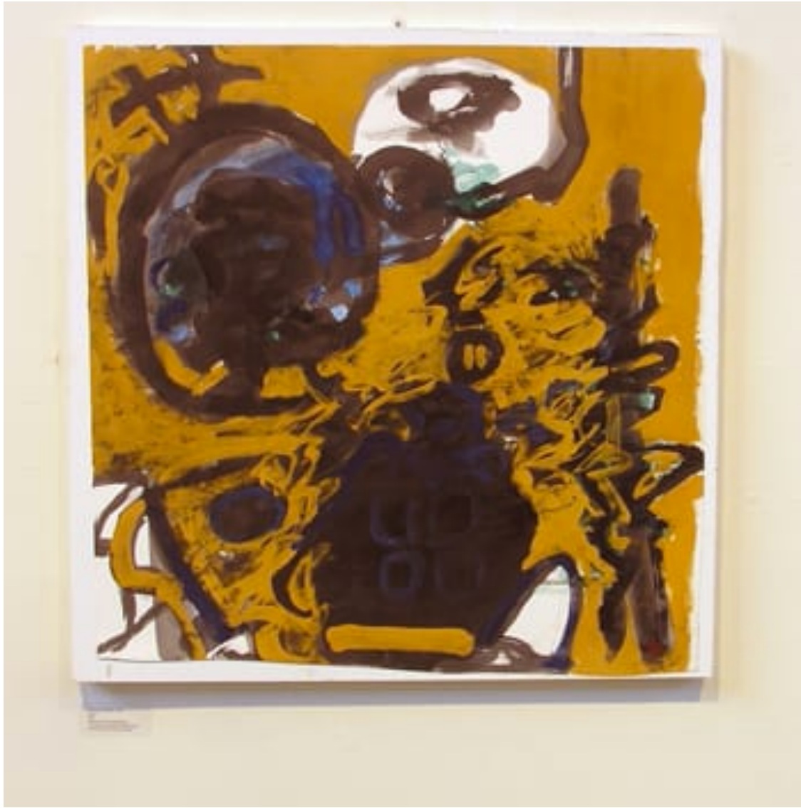
Lotus , Bernice Bing, 1990, Mixed media on Rag Paper, Courtesy of the Bernice Bing Estate