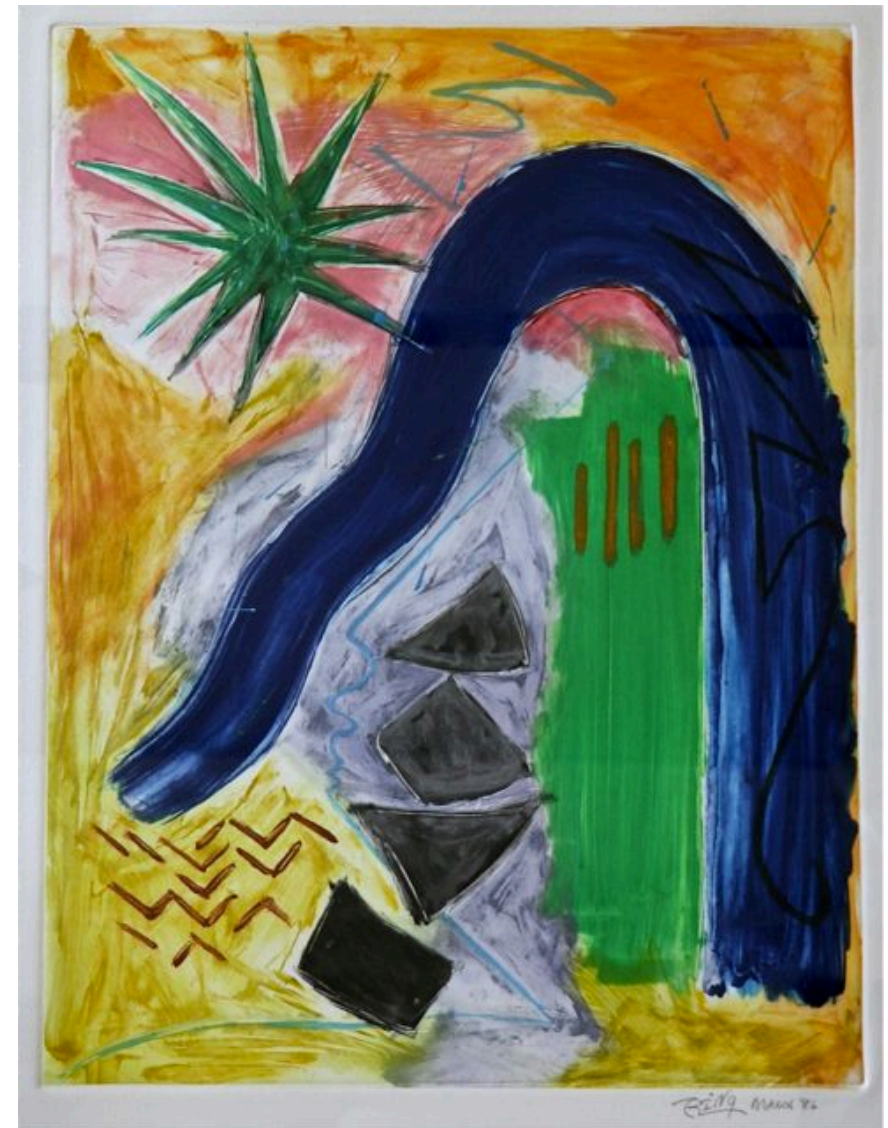
March '86 , 1986, Bernice Bing, Monoprint.