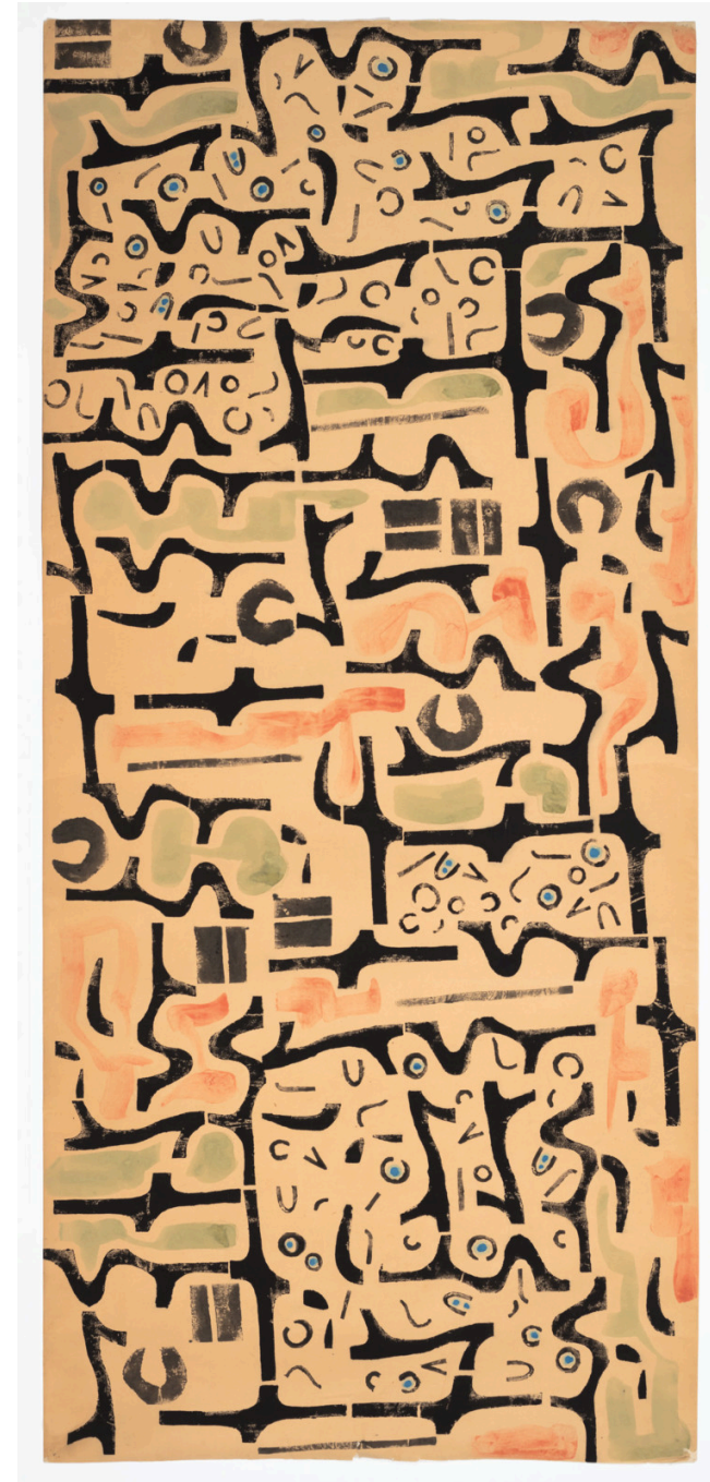
Great Chorus, Saburo Hasegawa, 1952. Ink on paper.