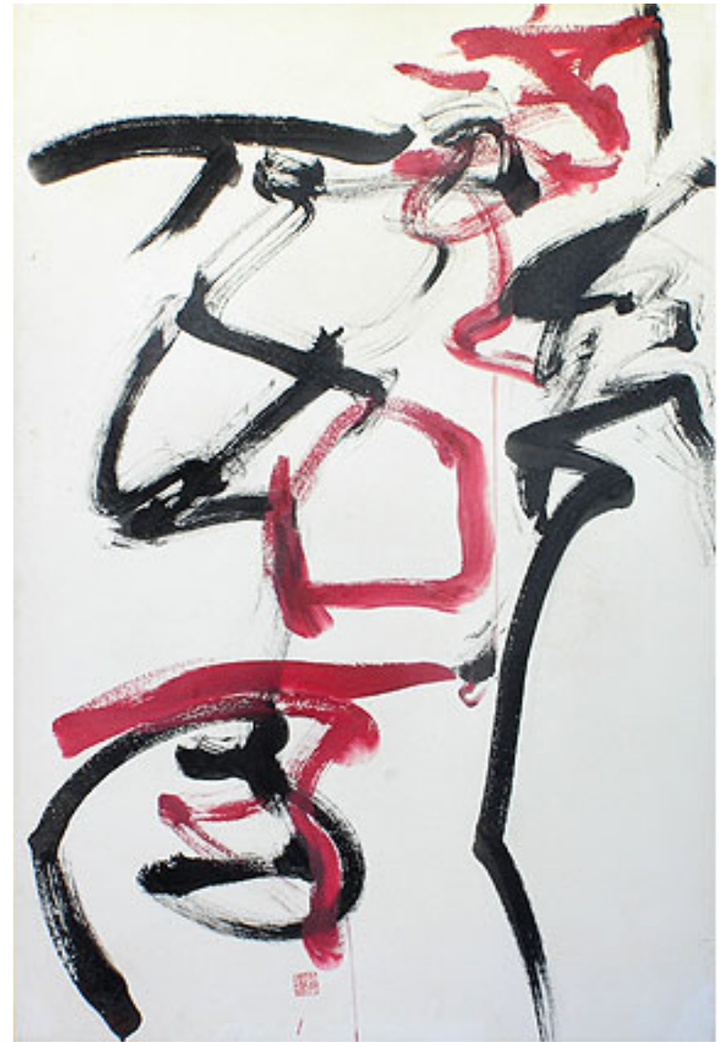
Abstract Calligraphy , 1987, Bernice Bing, Mixed media, 35" x 24", Collection of Bernice Bing Estate