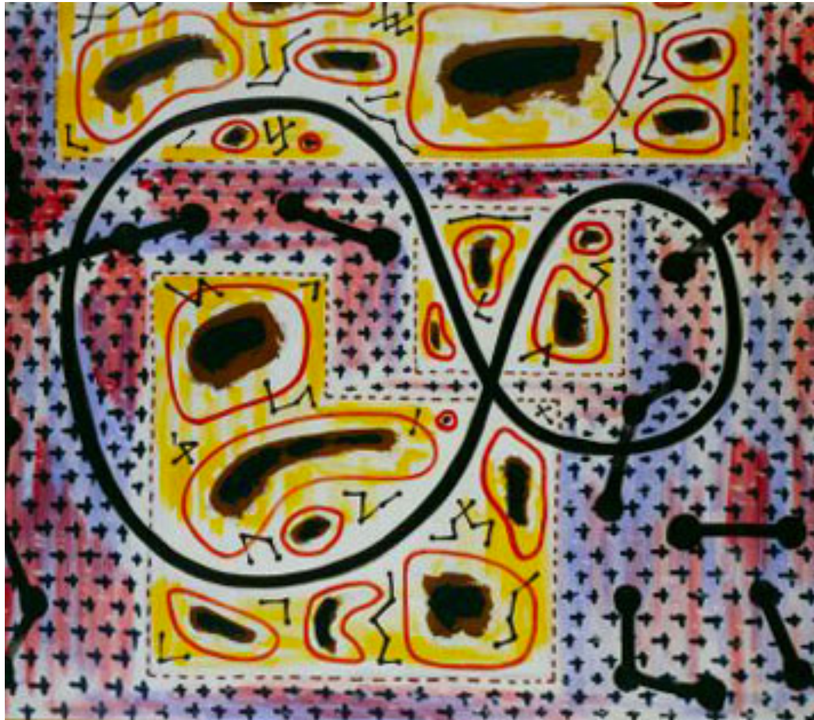
Locus of a Butterfly , 1937, Saburo Hasegawa, Oil on canvas, 130x163 cm. National Museum of Modern Art, Kyoto