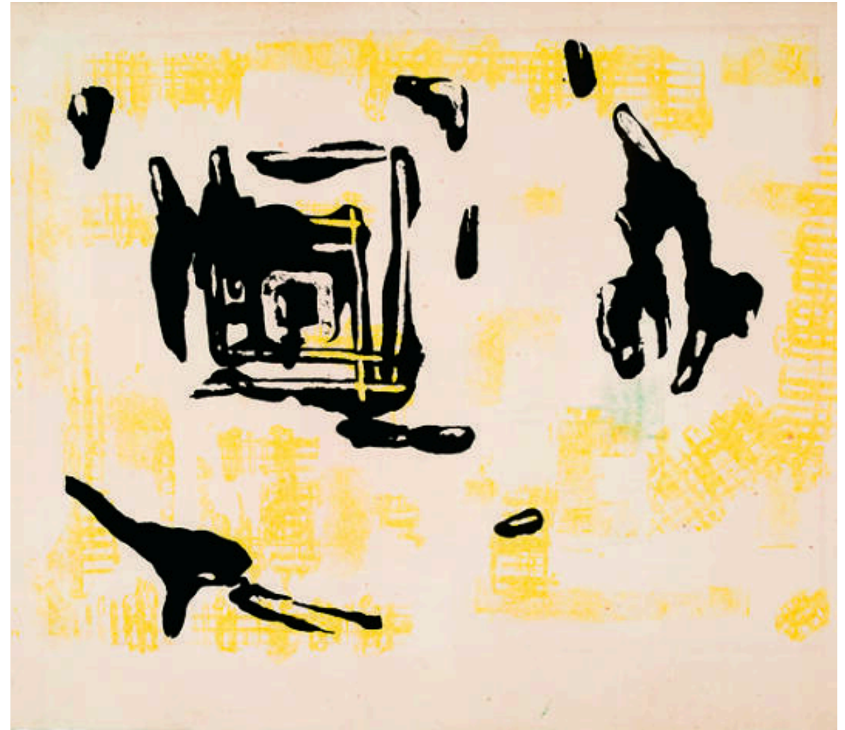
Untitled' , 1952, Saburo Hasegawa.