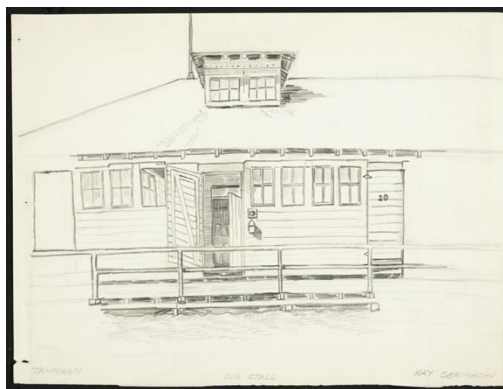
Our Stall, Tanforan , ca. 1942–1944.

Introduction: After the Japanese bombing of Pearl Harbor on December 7, 1941, President Roosevelt issued Executive Order 9066. Signed on February 19, 1942, the order gave the military broad powers to ban and evacuate any citizen on the West Coast, including California. While Executive Order 9066 applied to “any or all persons,” the newly established War Relocation Authority (WRA) began deporting approximately 120,000 Japanese immigrants (Issei) and Americans of Japanese descent (Nisei) first to assembly centers, and then to internment camps. The WRA relocated them to ten internment camps built in deserts and swamplands, including in Topaz, Utah. The relocation of Japanese Americans uprooted entire communities, as they were forced to leave their homes and jobs.