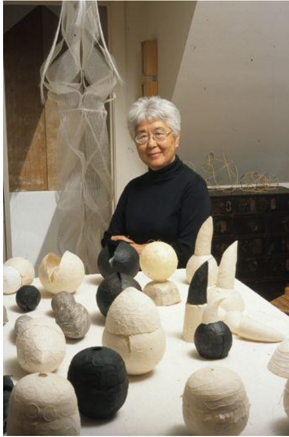
Kay Sekimachi (b. 1926– )