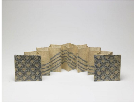
Woven Book: Wave , 1980.